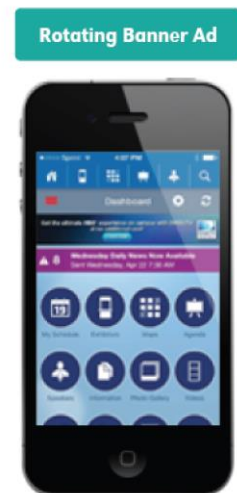
Banner ads rotate at the top of the app Dashboard page, and click through to a full-screen App Landing Page.

Specifications: 640Wx110H pixels, .jpg or .png format, 300 dpi